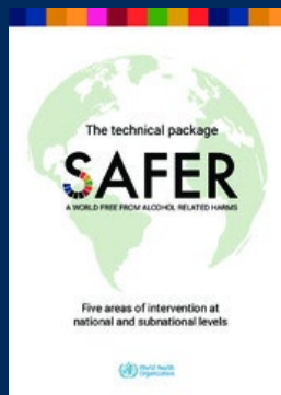
Global alcohol action plan 2022–2030 and SAFER technical package